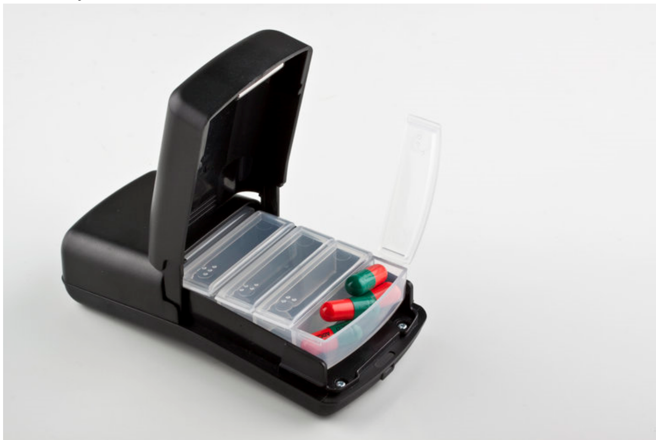
Figure 1. The Wisepill device.

Semistructured qualitative interviews were conducted after month 3 (known as interview 1) and after the first 48-hour lapse (known as interview 2), or at study exit if there was no such lapse (also known as interview 2), reflecting two planned interviews per participant. In-depth semistructured interviews with a purposeful sample of social supporters were conducted within 2 weeks of a lapse by their respective study participant. Their selection was based on the study participant’s explanation for the lapse, social support characteristics, and variations in the types of social support provided. Closed and open-ended questions were asked of social supporters at exit exploring various aspects such as challenges and experiences to social support and understanding of and responses to the intervention SMS notifications and the type of voluntary and requested help or support presently given to the study participant toward adherence.