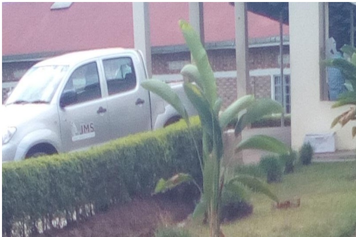
Joint Medical Store delivering drugs at RMH