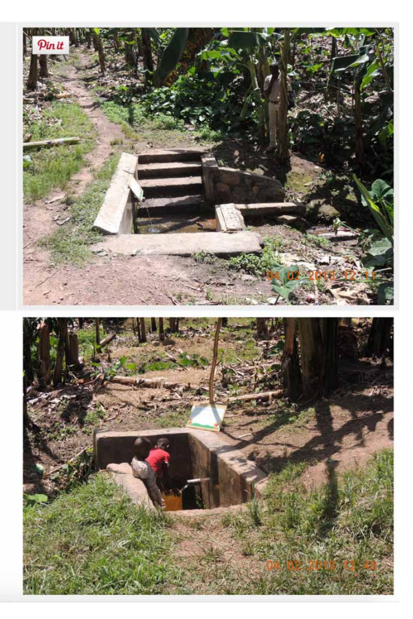
Figure 2 | Sample query results (English language version) for photo-assisted identification of household water source using Computer Assisted Survey Information Collection (CASIC) Builder™ software.

Water source number: 2 Cell: Nyamikanja 2 Village: Kyaritimbo Type: Spring Name: Kyaritimbo <u>Select</u>