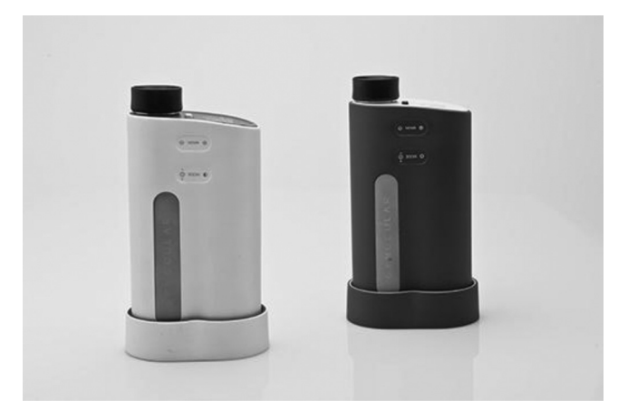
Figure 1. The Gynocular.

Statistical Analysis. Data were entered into MS Excel and exported to Stata version 11 (College Station, TX) for analysis. The baseline patient characteristics were summarized using means and frequencies (see Table 2). To test the level of agreement between the colposcopy and Gynocular, we calculated the percentage agreement