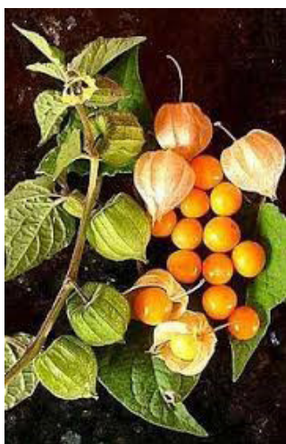
Figure 1. Aerial parts and fruit of Physalis peruviana L..

As shown in Table 1, P. peruviana contains various primary and secondary metabolites isolated from different parts. More than 40 chemical constituents belonging to aldehydes, alkaloids, carbohydrates, carotenoids, esters,