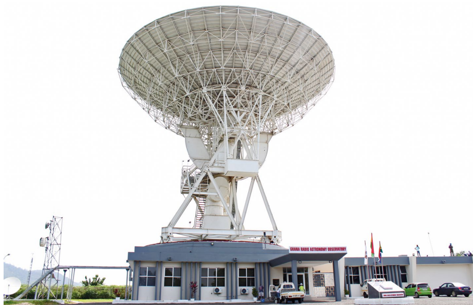
Fig. 2 | The Ghana Radio Astronomy Observatory, Kuntunse. The Ghanaian engineers were trained by South African experts.

Space Technology was established under the NUST. There are plans to build the first millimetre-wave radio telescope in Africa in Namibia (together with the Netherlands) 5 .